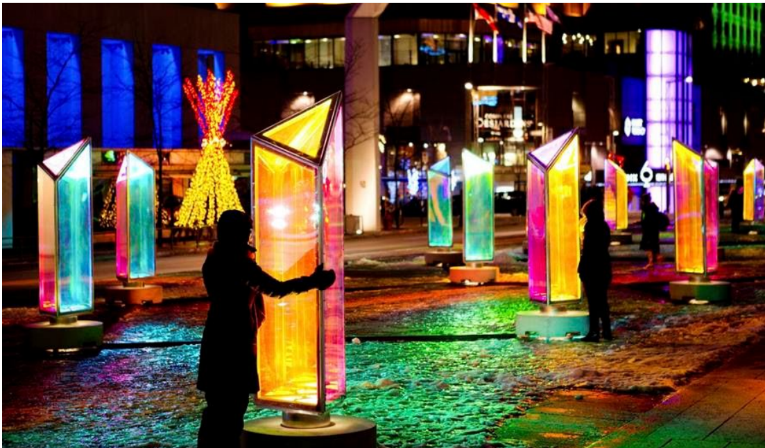
Prismatica, a creation by Raw Design in collaboration with Atomic3, Quartier des spectacles, Montréal.

Downtown Alliance Hosts Temporary Art Installation Along Water Street